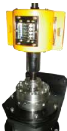
Torque Sensor System