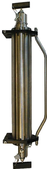
BOPT7-10 with handle support